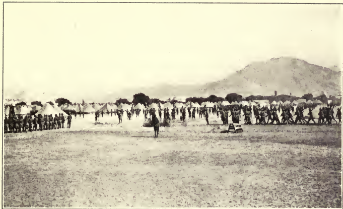
MORNING DRILL AT CAMP COTTON